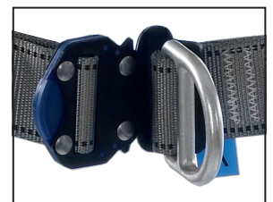
Quick-release buckle with buckle (chest), forged steel