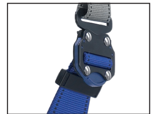
quick release buckles (steel)