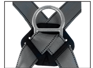
D ring (steel)