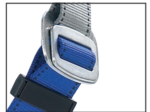
quick connect (leg) Galvanically galvanized