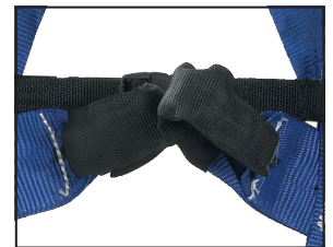
front fall arrest attachment loops in the chest area